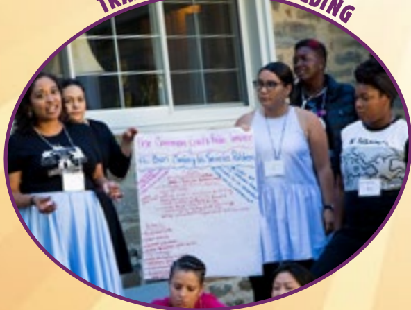
TRAINING & SKILLS BUILDING