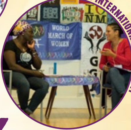
GRASSROOTS INTERNATIONALIST FEMINISM