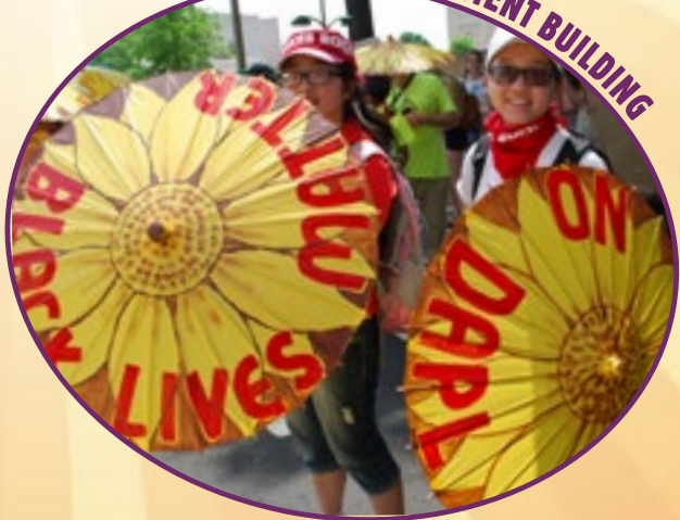
CROSS SECTOR MOVEMENT BUILDING