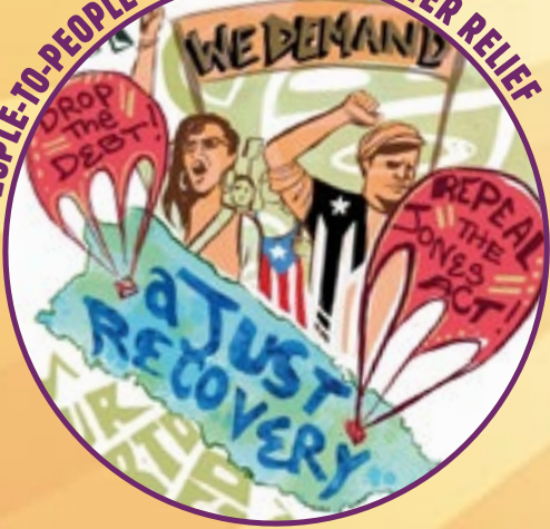
PEOPLE-TO-PEOPLE GRASSROOTS DISASTER RELIEF