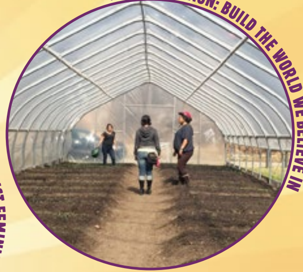
JUST TRANSITION: BUILD THE WORLD WE BELIEVE IN